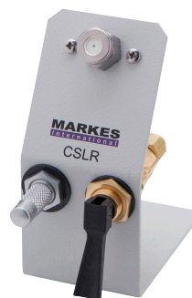
Figure 1: The Calibration Solution Loading Rig (CSLR™).

Markes' Calibration Solution Loading Rig (CSLR™) (Figure 1) has been designed specifically for loading sorbent tubes with gas- or liquid-phase standards, and complies with key TD standard methods such as ISO 16017, US EPA Method TO-17 and ASTM D6196.